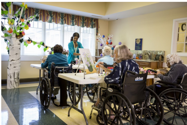
Arts and crafts

Visit www.AGRhodes.org for current room rates. The cost and availability of some services not listed above, such as transportation to and from medical appointments, may vary.